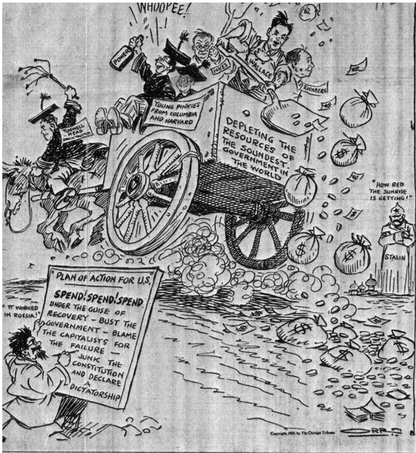
Cartoon from Chicago Tribune 1934; Those who ignore past mistakes are bound to repeat them.