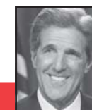
John F. Kerry (D)