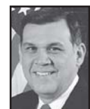
Mel Martinez (R)