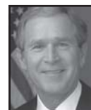
George W. Bush (R)